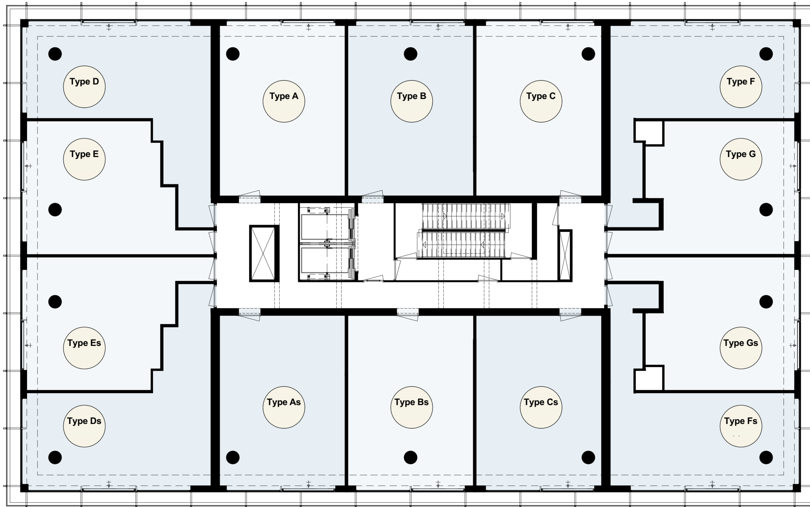
VERDIEPING 1 t/m 7